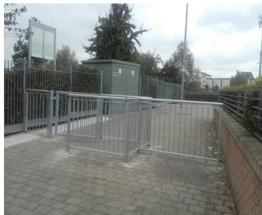
The new raised bed recently installed at Ratoath Estate and the kissing gate fitted at the laneway between Willow Park Road and Poppintree Crescent